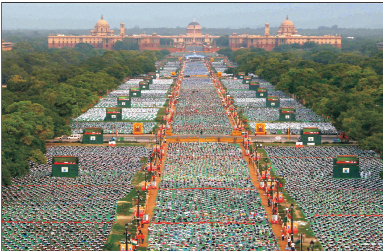
Panoramic view of mass Yoga demonstration at Rajpath, New Delhi.

which began in 2001, has spread to all parts of the country. All sections of the general public visit AROGYA fairs. The fairs are organized in association with the concerned State Government and Trade Promotion Organization. It has been the endeavor of the Ministry to make innovations in the successive AROGYAs over the years. As a result, what began as an exhibition of AYUSH products in 2001, has expanded over the years to include literature on AYUSH, medical equipments, publishers and booksellers of AYUSH systems apart from events which are organized on the sidelines of AROGYA like Conferences on traditional Medicine. Free health Checkup is major attraction of the fair.