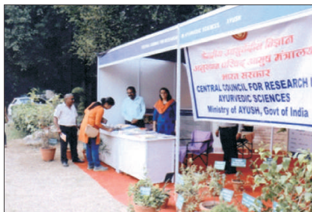
Hon'ble Chief Minister of NCT Government Delhi Sr. Arvind Kejariwal along with Dy. Chief Minister Sr. Manish Sisodia visiting the East Festival organized at 11, Man Singh Road, New Delhi from 16 th to 18th October, 2015. ACRI, Punjabi Bagh has participated in the event on behalf of the CCRAS

distribution of brochures for health awareness were the activities of the Council during the event.