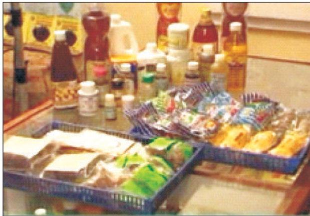
Bealth Products at Health Shop