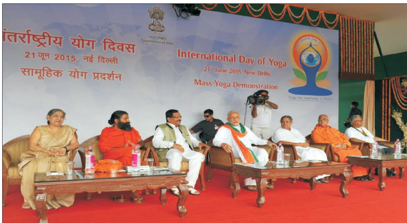
Hon'ble Prime Minister Sh. Narendra Modi along with dignitaries on International Day of Yoga.

the United Nations General Assembly during its 69 th Session, the Ministry of AYUSH, Government of India organised a two day "International Conference on Yoga for Holistic Health" during 21-22 June, 2015 at Vigyan Bhawan, New Delhi, India, as a part of celebration of first IDY during 2015.