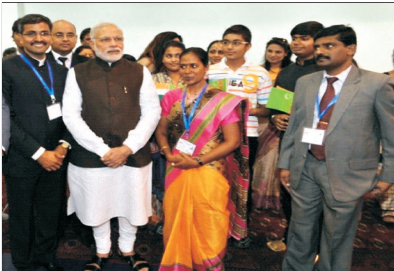
Honorable Prime Minister of India Shri Narendra Modi Ji, at inaugural function of Yoga and Traditional Medicine Center at Ashgabat, Turkmenistan on 11 th July, 2015.