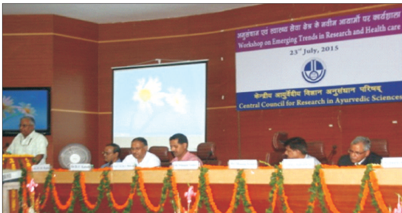
An inaugural view of Workshop