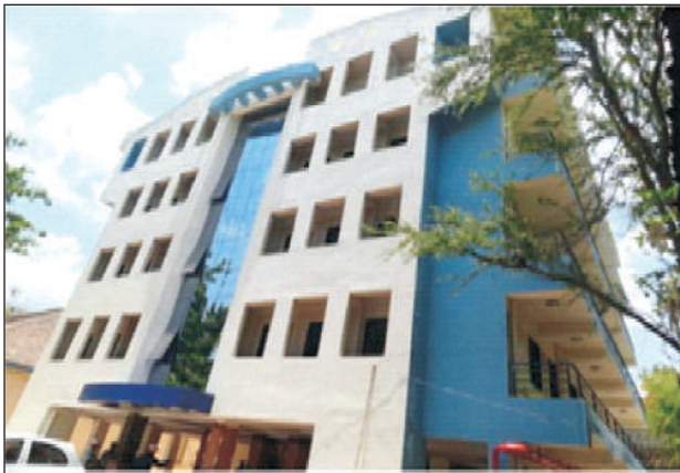
New OPD Building

Naturopathic medicine for prevention and cure of diseases and promotion of healthy living.