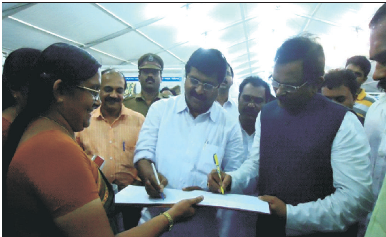
Shripad Yesso Naik, Hon'ble MoS, IC, Ministry of AYUSH, Govt. of India inaugurating the National Level Arogya Fair on 21 st May, 2015 at Poojapura Ground, Thiruvananthapuram organized by Ministry of AYUSH in collaboration with World Ayurveda Foundation (WAF) & State Government of Kerala