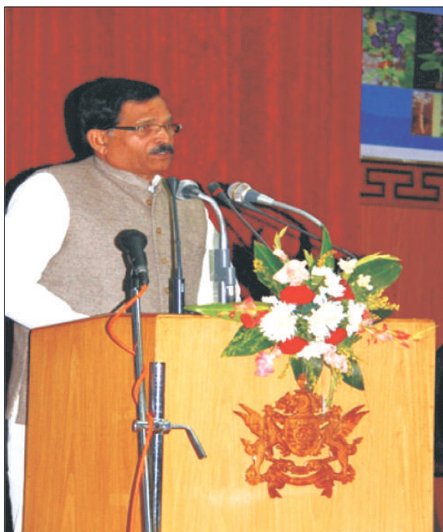
Shri. Shripad Yesso Naik, Hon'ble MoS (IC) Ministry of AYUSH addressing during the inaugural session of the National Seminar at Gangtok on 20 th November, 2015