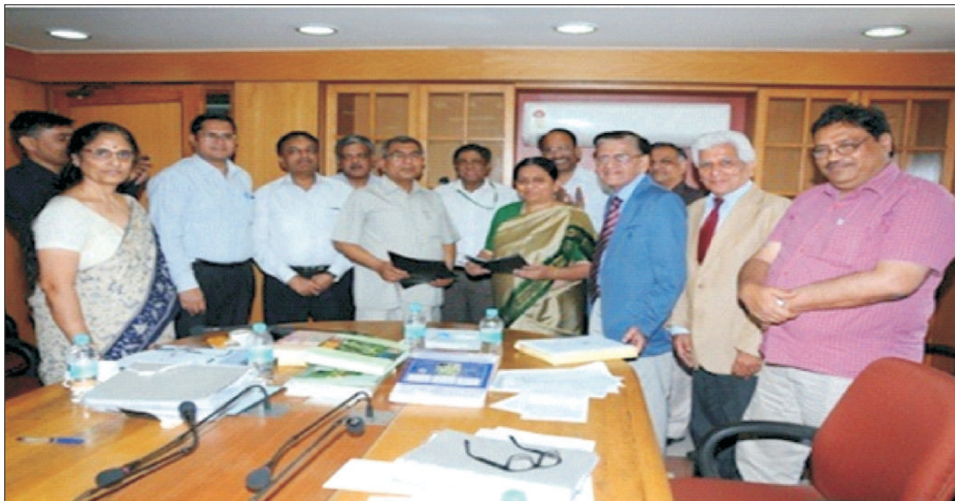
Dignitaries of PCIM&H and ICMR exhibiting MoU documents

national importance, Commission has signed a Memorandum of Understanding (MoU) with Indian Council for Medical Research (ICMR). The venture has resulted in securing 120 PRS samples with associated