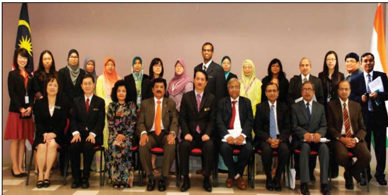
2 nd Bilateral Technical Meeting on Cooperation in the field of Traditional Systems of Medicine between the Government of Malaysia and the Republic of India on 26 th March 2014 at Kuala Lumpur, Malaysia

13.2.8 A three member delegation led by Secretary, AYUSH had participated in the 2 nd Bilateral Meeting organized by the Ministry of Health, Government of Malaysia on 26 th March, 2014 under the provisions of Memorandum of Understanding (MoU) signed between India and Malaysia on 'Cooperation in the field of Traditional Medicine'. The Malaysian side was led by Director General of Health, Ministry of Health. The two delegations deliberated various issues extensively and took stock of progress made in the cooperation between two countries. The Malaysian side appreciated the growth of AYUSH Systems of Medicine in India. The delegation also