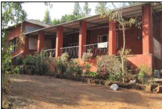
Sanatorium for HIV+ve Patients at Panchagani, Satara