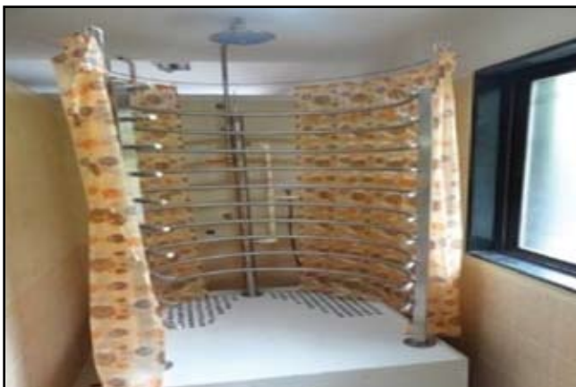
Circular Jet Bath