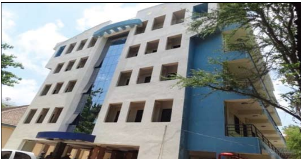
NEW OUT PATIENT DEPARTMENT AT NIN, PUNE

6.5.2.3. The New Out Patient Department (OPD) : The New Out Patient Department at NIN is functional with all modern Naturopathy equipments from June, 2013.