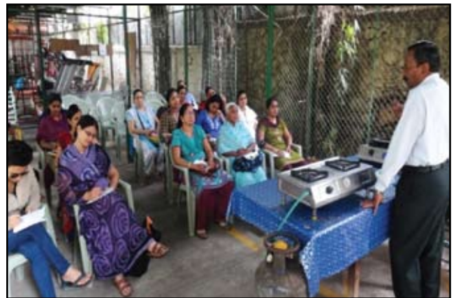
‘Cookery Classes’ at NIN, Pune