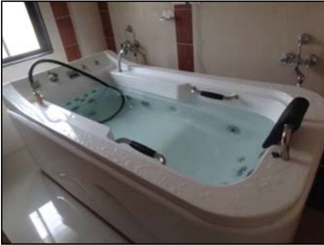
Under Water Massage