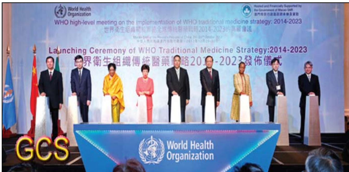
The then Hon’ble Health Minister of State, Mrs. Santosh Chowdhary along with the Director General, WHO Mrs. Margaret Chan and Health Ministers of other participating countries during Joint Launching of WHO Traditional Medicine Strategy: 2014-2023 on 28 th October, 2013 at WHO High Level Meeting in Macau.

13.2.2 The “Delhi Declaration on Traditional Medicine for the South-East Asian Countries” was unanimously adopted by the Hon’ble Health Ministers of Bangladesh, Bhutan, India, Nepal, Minister of Indigenous Medicine of Sri Lanka, Vice Minister of Timor Leste and representatives of DPR Korea, Indonesia, Myanmar, Maldives and Thailand during the ‘International Conference on Traditional Medicine for South-East Asian Countries’ held in New Delhi during 12-14 February, 2014. After determined efforts of the Department of AYUSH, as a follow up, the matter was taken for the first time in the