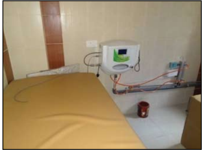
Colon Hydro therapy