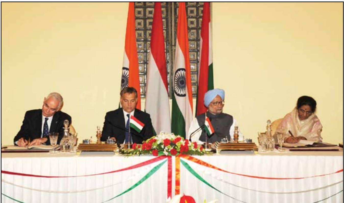
Signing of MoU between India and Hungary on cooperation in the field of Traditional Systems of Medicine

13.2.4 A Memorandum of Understanding between the Ministry of Human Resources of Hungary and the Ministry of Health and Family Welfare of the Republic of India on Cooperation in the field of Traditional Systems of Medicine was signed on 17.10.2013. The Memorandum of Understanding was signed by Smt. Santosh Chowdhary, Minister of State for Health & Family Welfare, Government of India and Mr. Zoltan Balog, Minister of Human Resources of Hungary at New Delhi in the presence of the Prime Ministers of both the countries. The MoU aims at strengthening, promoting and developing co-operation in the field of traditional systems of medicine between the two countries on the basis of equality and mutual benefit. The MoU encourages and promotes co-operation to enhance the use of traditional systems of medicine; promote mutual exchange of regulatory information on operational licensing to practice traditional medicine and on marketing authorisation of medicines in both countries;