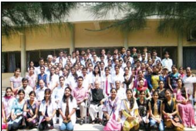
NIN Orientation Program in Vadodara