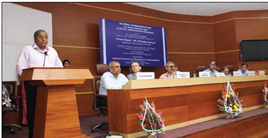
Sh. Nilanjan Sanyal, Secretary (AYUSH) at Inaugural function of Global Harmonization of Drug Proving and Clinical verification Programme at CCRH Hqrs.

Literature Awareness Services have been published. Annual report (2012-13) of the Council was submitted to both houses of Parliament. The major achievement of this period is that Council's research journal has become 'Open Access Online' for wider and easy accessibility. Five books including drug monographs Cassia fistula , Thea chinensis and Alfalfa , Drug proving Volume – 5 and Vernacular names of Plant Drugs in Homoeopathic Pharmacopoeia of India have been published. Compilation of one drug monograph and one disease monograph are under progress. IEC material on BPH and Menopause has been published. Council's publications have been made available for sale online. The conversion of Council's publications into e-books is in progress.