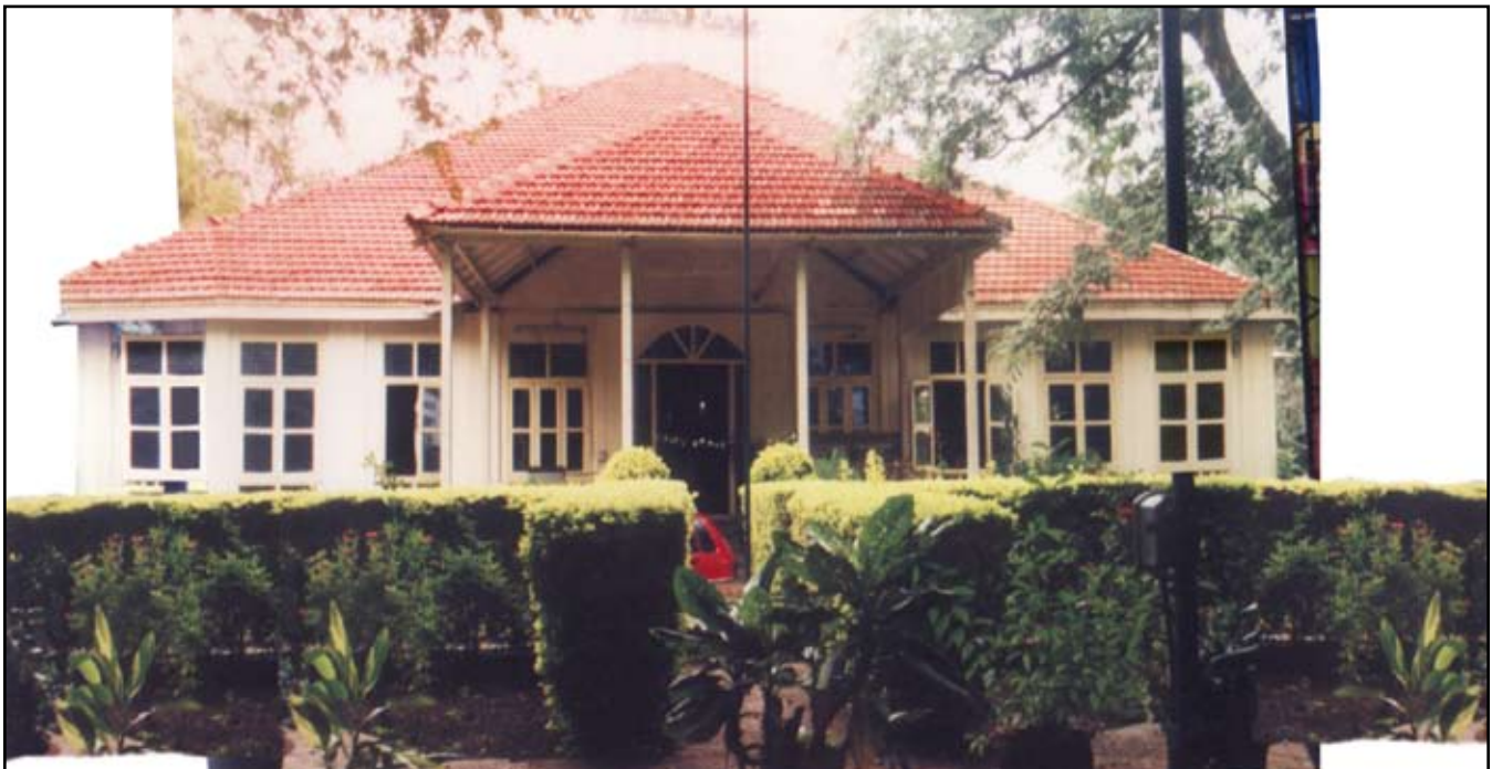
"THE BAPU BHAVAN", NIN, PUNE