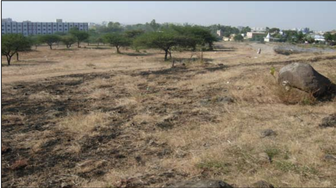
LOCATION OF LAND AT KONDHWA, PUNE