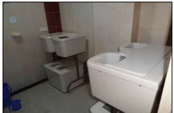
Foot Arm Bath