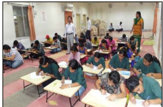
"Shuddh Lekhan" Competition during Hindi Pakhwada