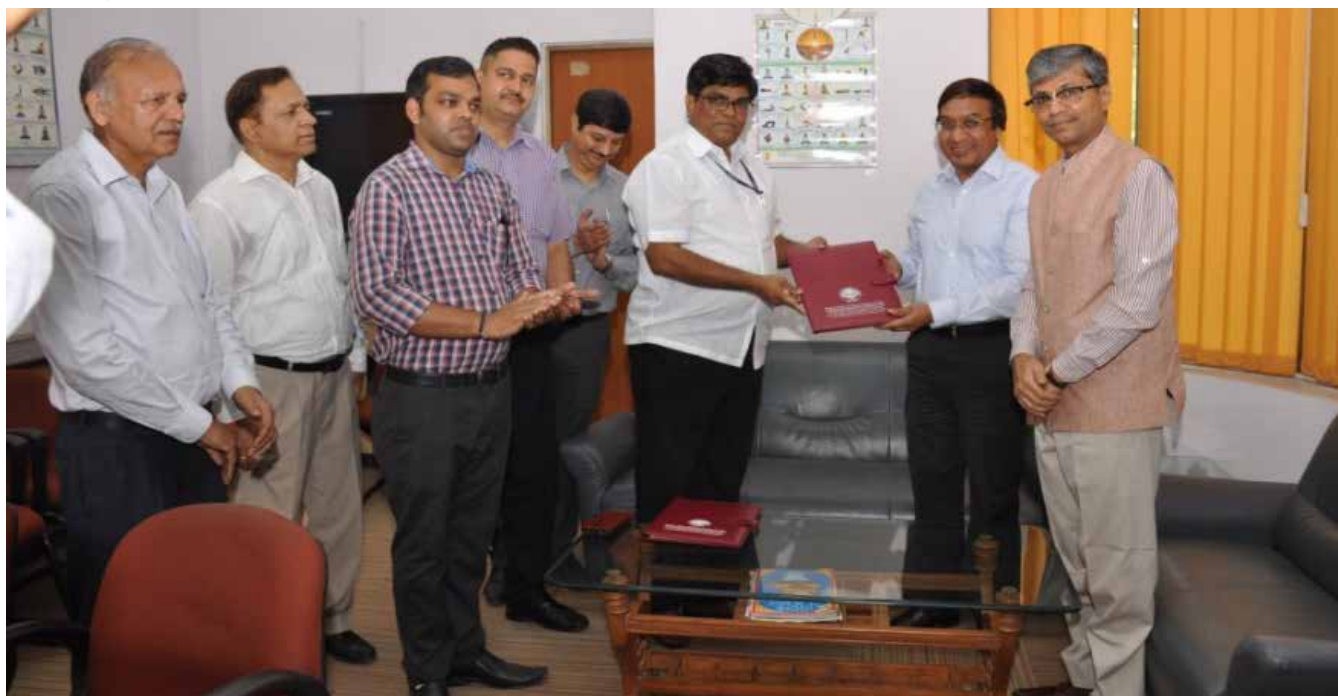
MoU signed between AIIA and Morarji Desai National Institute of Yoga