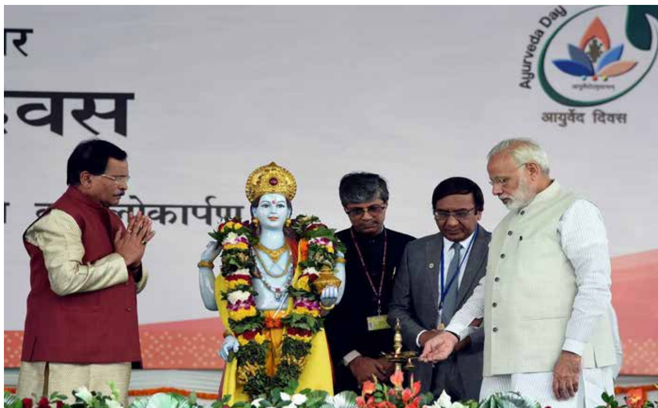
Dedication of AIIA to the country by Honble Prime Minister of India

An MoU has been signed with Morarji Desai National Institute of Yoga (MDNIY) on 18 th Sept. 2017 for promoting Yoga related activities.