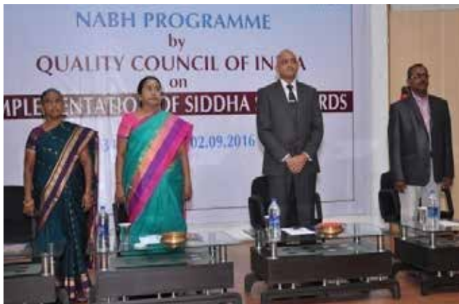
Inauguration of NABH – POI of Siddha Standards in NIS on 31-8-2016