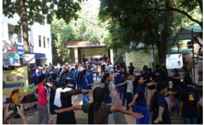
A view of IDY