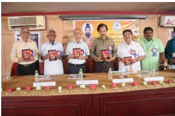
Figure 1: DIRECTOR GENERAL, CCRS AND OTHER DIGNITARIES DURING THE INAUGURATION OF THE NATIONAL SEMINAR ON “GLORY OF SIDDHAR AGATHIYAR AND HIS CONTRIBUTION TO SIDDHA SYSTEM OF MEDICINE” ON 26TH & 27TH AUGUST, 2017