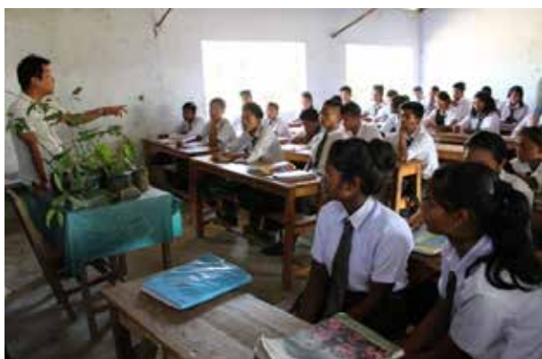
Uttarakhand: Lecture on Medicinal Plants