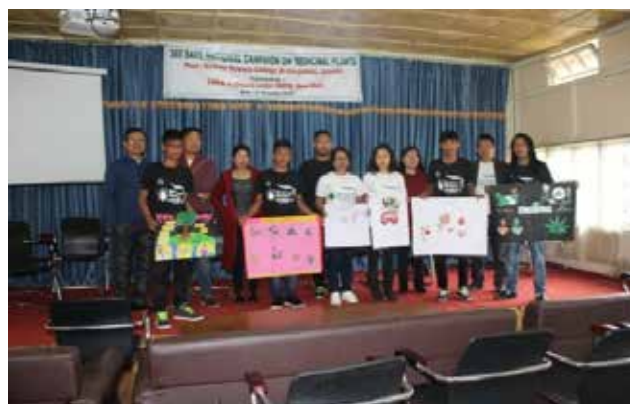
Nagaland: Drawing Competition