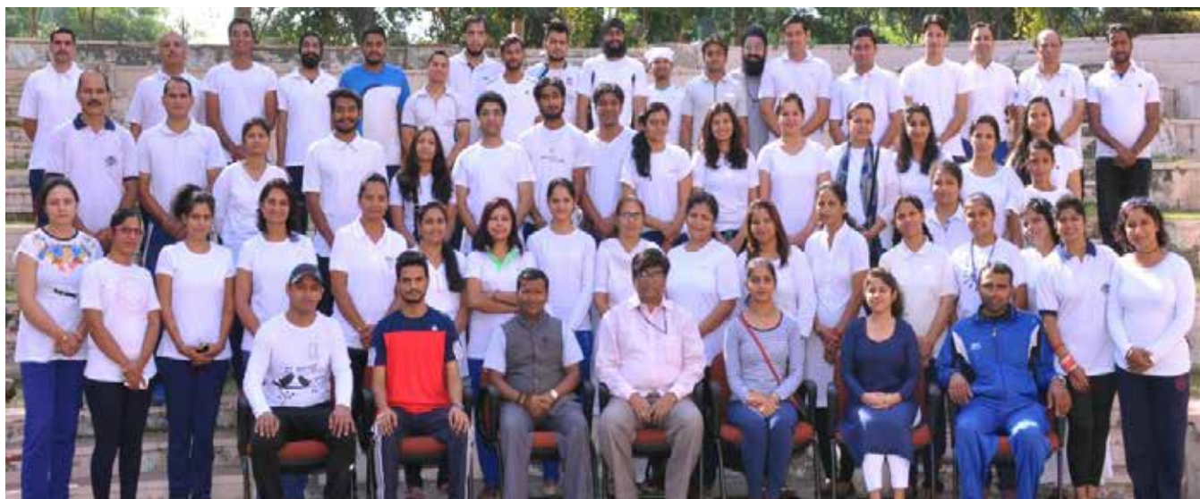
Director and staff of the Institute along with the participants of Foundation Course in Yoga Science for Wellness Batch at SAI Stadia.