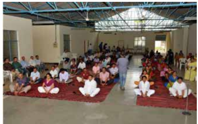
Yoga session is in progress