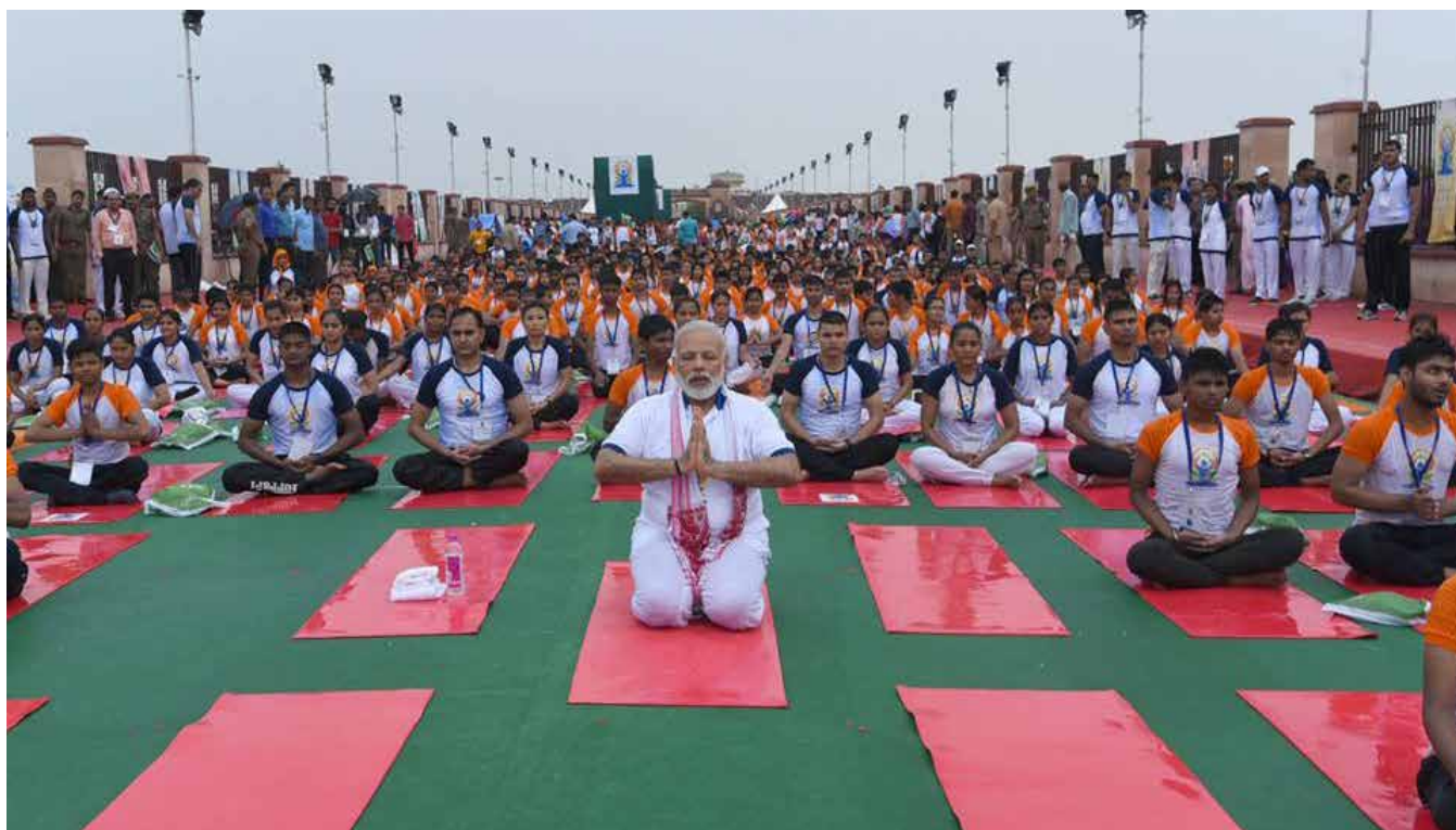
Hon'ble Prime Minister Shri Narendra Modi performing Yoga on 3 rd International Day of Yoga (21.06.2017) at Lucknow

The Ramamanilyengar Memorial Yoga Institute has been selected as the first recipient of the Prime Minister's Award for outstanding contribution to promotion and development of Yoga. The institution of the award was announced by the Prime Minister on the occasion of the Second International Day of Yoga at Chandigarh on 21st June, 2016.