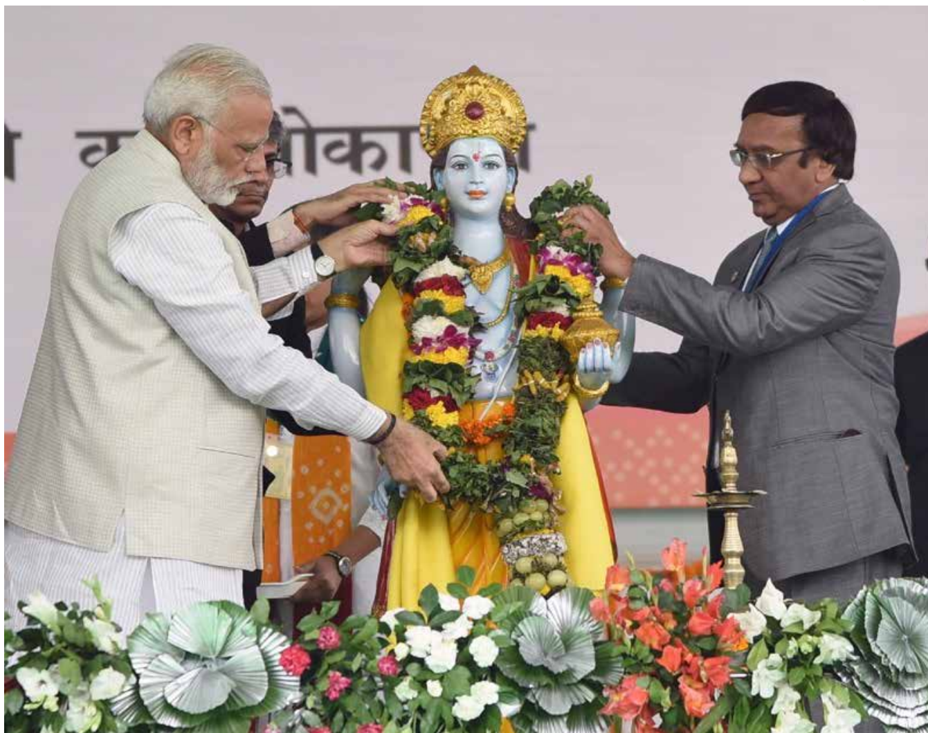
Shri Narendra Modi, Hon'ble Prime Minister garlanding the statue of Dhanwantri during the celebration of 2 nd Ayurveda Day (17.10.2017)