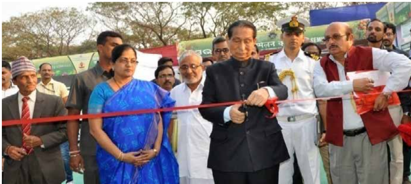
Dr. S.C Jamir, Hon'ble Governor of Odisha inaugurating the National Natural Food Festival at Janata Maidan, Bhubaneswar on 10th Feb 2017