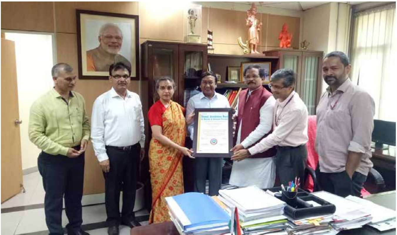
AIIA receiving the certificate of NABH Accreditation