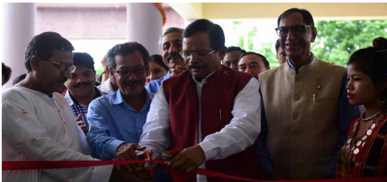
The Virology Laboratory at DACRRI(H) Kolkata was also inaugurated by Sh. Shripad Yesso Naik, Hon'ble Minister of State (Independent Charge), Ministry of AYUSH, Govt. of India on 12 th September 2017.

Regional Research Institute for Homoeopathy, Tripura, developed on 2.05 acres of land was recently inaugurated by Hon'ble Minister of AYUSH, Sh. Shripad Yesso Naik in the presence of Sh. Shankar Prasad Dutta, Hon'ble MP West Tripura and Sh. Monoranjan Debbarma, Hon'ble MLA Mandai Bazar.