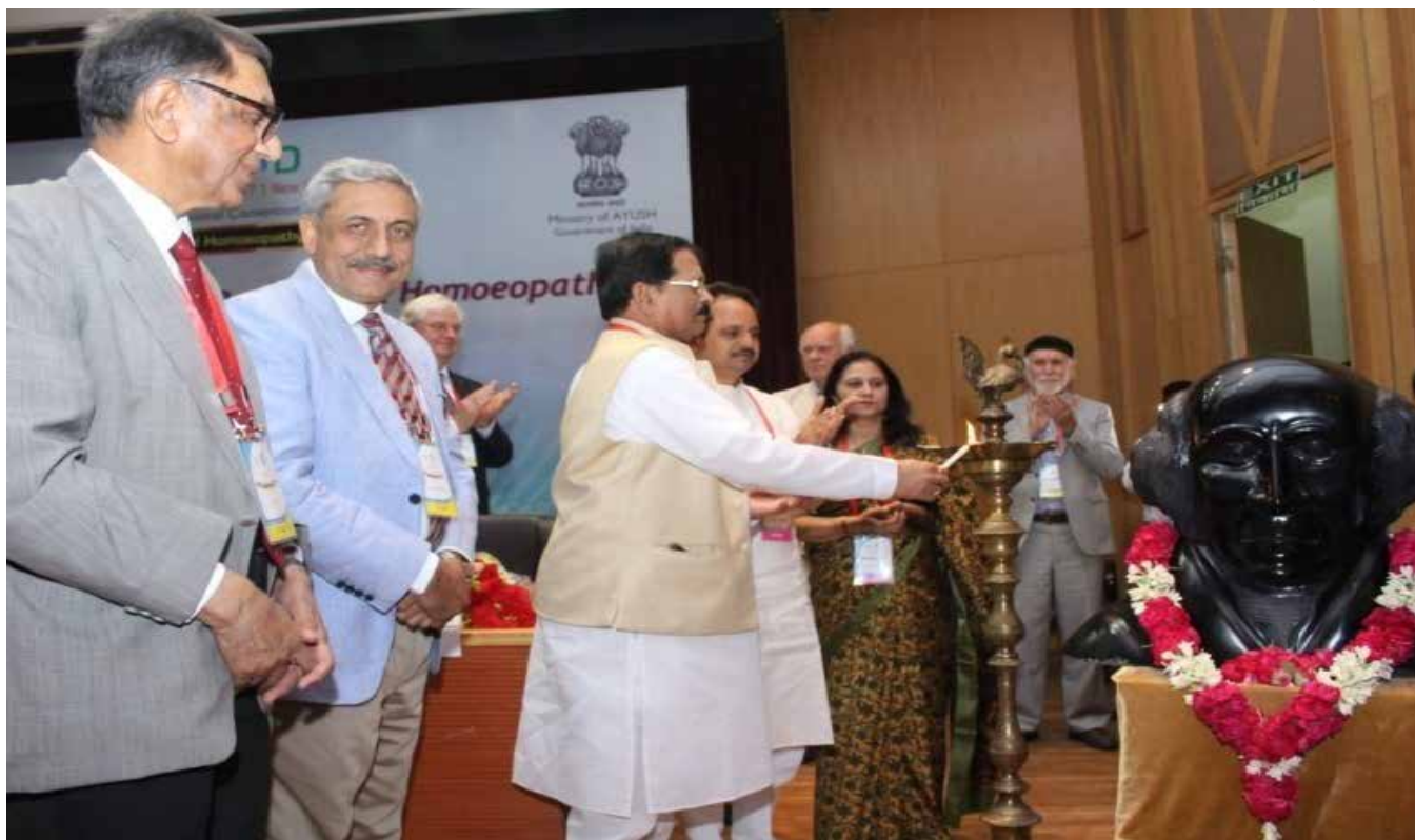
Hon'ble Minister of AYUSH lighting lamp on the occasion of World Homoeopathy Day