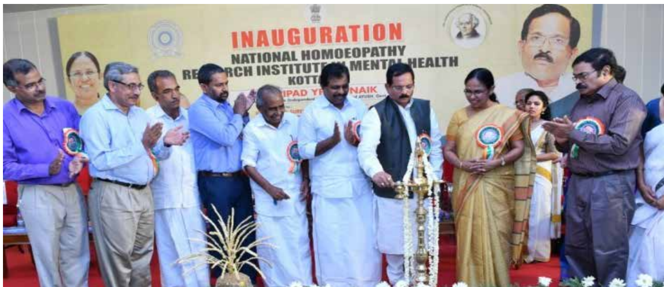
Sh. Shripad Yesso Naik, Hon'ble Minister of State for AYUSH, Govt. of India lighting the lamp on the occasion of inauguration of NHRIMH, Kottayam