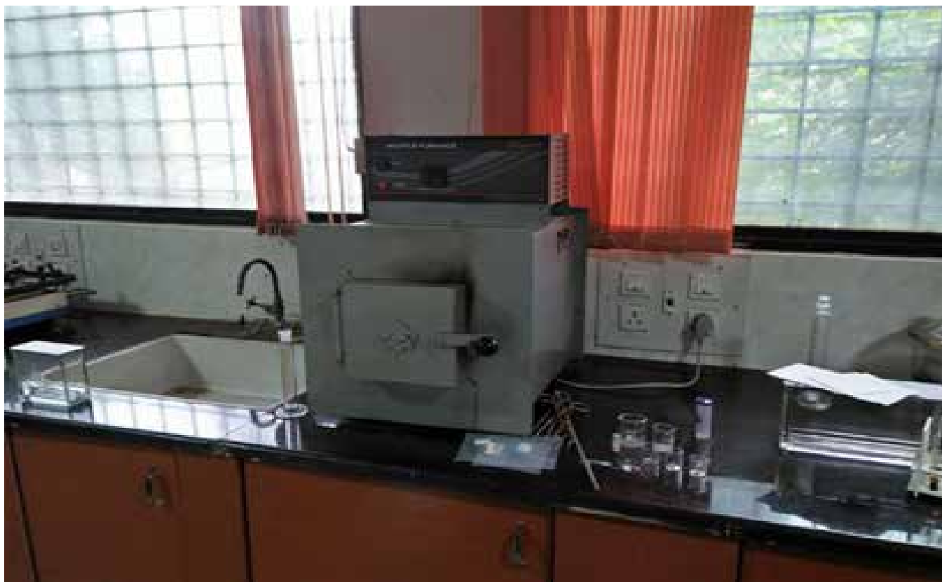
Drug Testing Laboratory, Bangalore, Karnataka