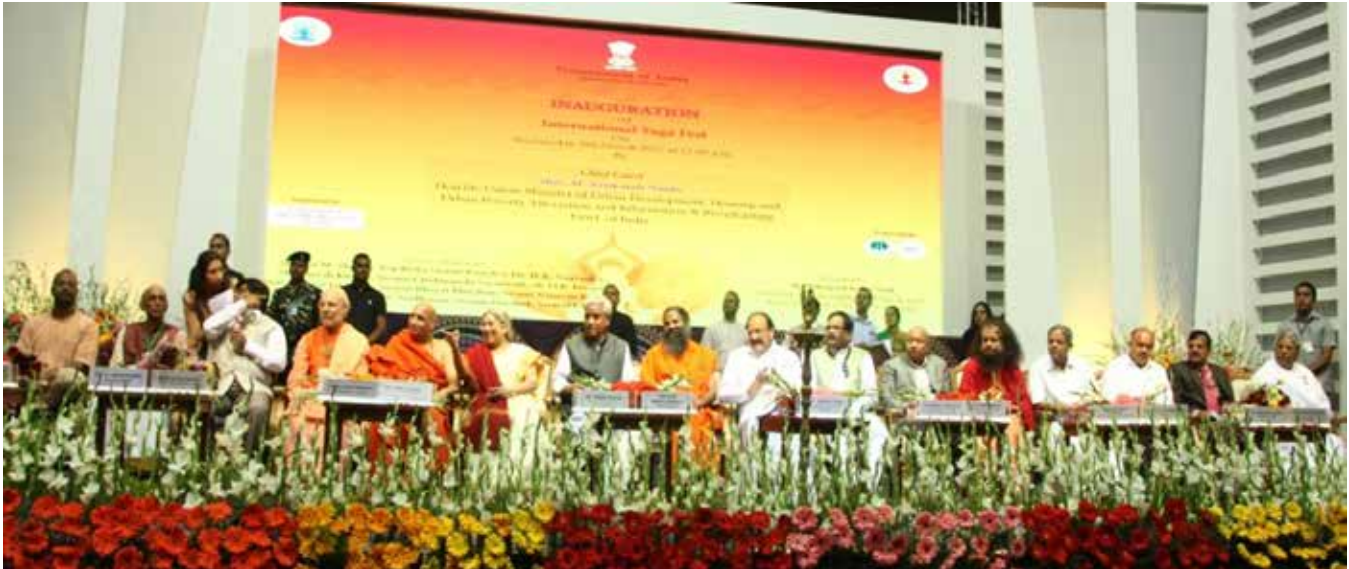
Dignitaries and Eminent Yoga Experts during the inaugural function of 2 nd International Yoga Fest on 8 th March, 2017 at Talkatora Stadium, New Delhi

The Fest witnessed the august presence and discourses by eminent Yoga Gurus and many others from Yoga fraternity. The revered Yoga Gurus and Masters shared their valuable views and enriched the audience throughout the fest. Throughout the event, Yoga workshops, Yoga demonstrations, Lectures, Satsang, Cultural programmes, etc. were organized.