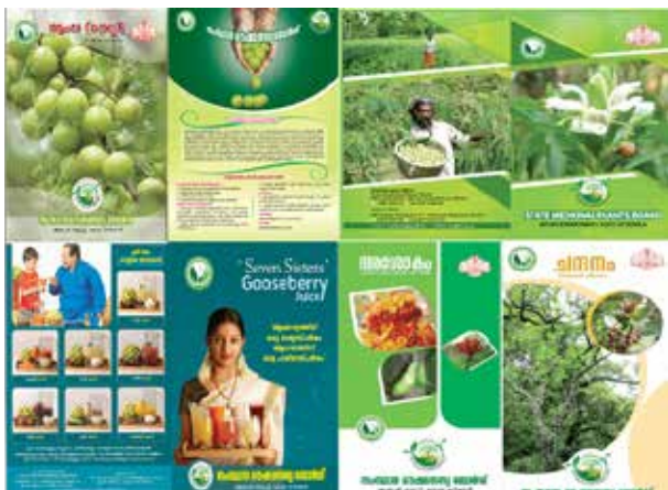
Kerala: Brochure Publication