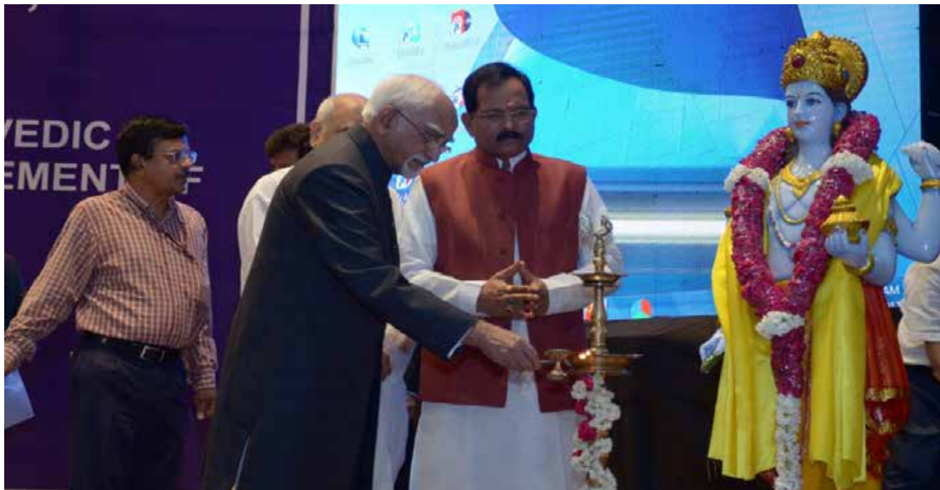
Hon'ble Vice President Shri Mohammad Hamid Ansari inaugurating the silver jubilee celebration function of Rashtriya Ayurveda Vidyapeeth held on 29th May, 2017 at Mavalankar Hall, Delhi