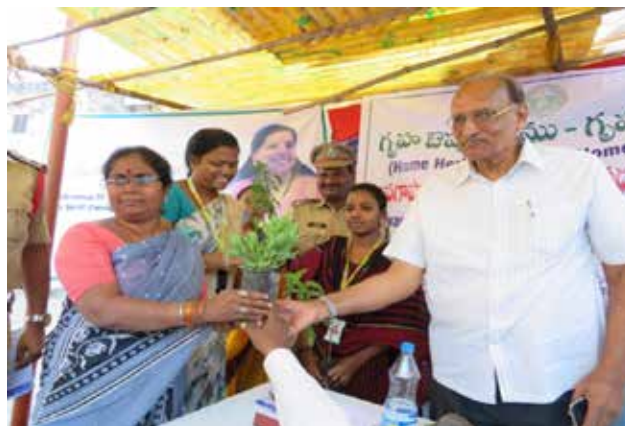
Telangana: Distribution of MPs