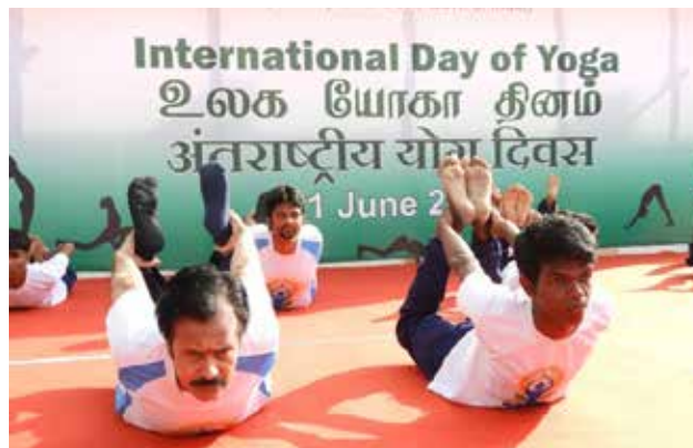
Figure 2: DIRECTOR GENERAL, CCRS PERFORMING YOGA ASANAS ON THE OCCASION OF INTERNATIONAL YOGA DAY