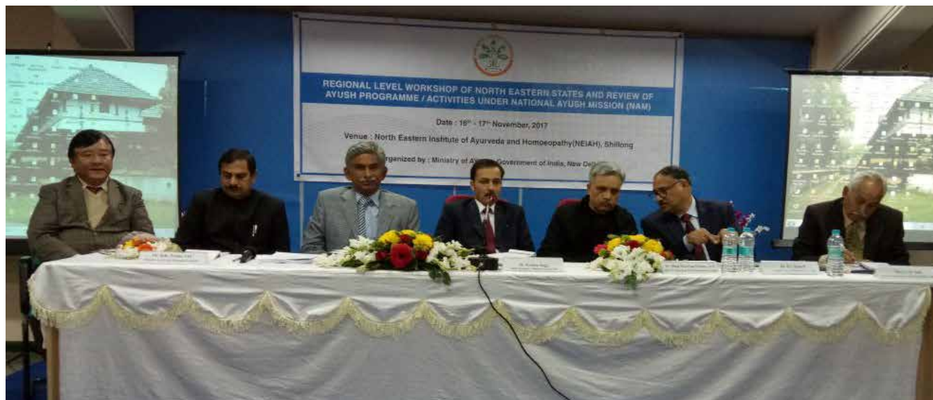
Regional Level Workshop held on 16-17 November, 2017 at NEIAH, Shillong

5.1.6 During the year 2017-18, State Annual Action Plans (SAAPs) from 32 States/UTs have been approved for the component of AYUSH Services, AYUSH Educational Institutions, Quality Control of Ayurveda, Siddha, Unani & Homoeopathy (ASU&H) Drugs and Medicinal Plants by the Mission Directorate and an amount of Rs.355.15 crore has been released up to 31 st December 2017.