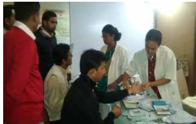
Siddha treatment care to Parliamentary staff