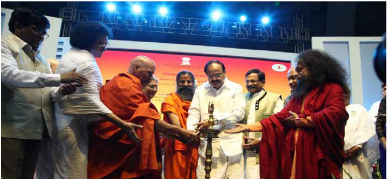
Sh. M. Venkaiah Naidu, Hon'ble Union Minister of Urban Development, Housing and Urban Poverty Alleviation and Information & Broadcasting, Govt. of India lighting the lamp during the 2 nd International Yoga Fest on 8 th March, 2017 at Talkatora Stadium, New Delhi

The Fest witnessed the august presence and discourses by eminent Yoga Gurus and many others from Yoga fraternity. The revered Yoga Gurus and Masters shared their valuable views and enriched the audience throughout the fest. Throughout the event, Yoga workshops, Yoga demonstrations, Lectures, Satsang, Cultural programmes, etc. were organized.