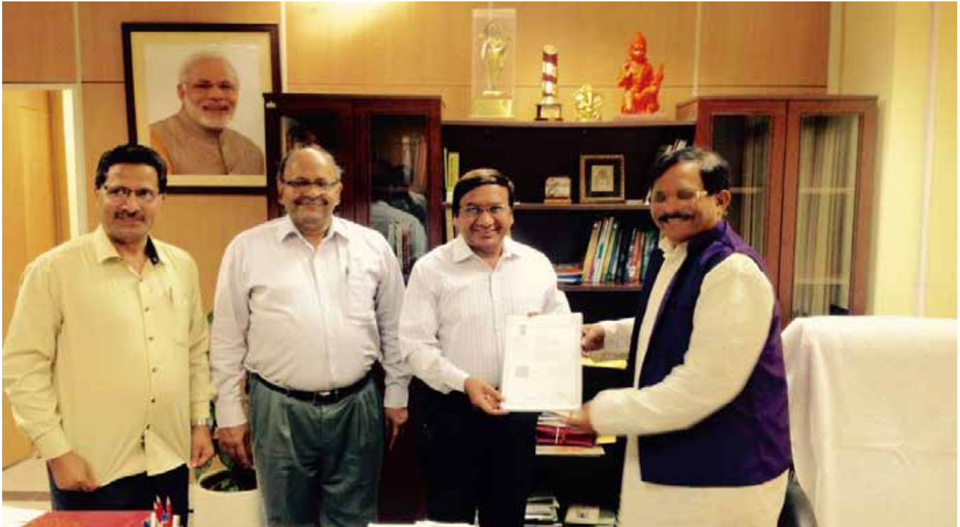
MoU with National Cancer Institute, AIIMS for research in cancer prevention & treatment (24 th March, 2017)