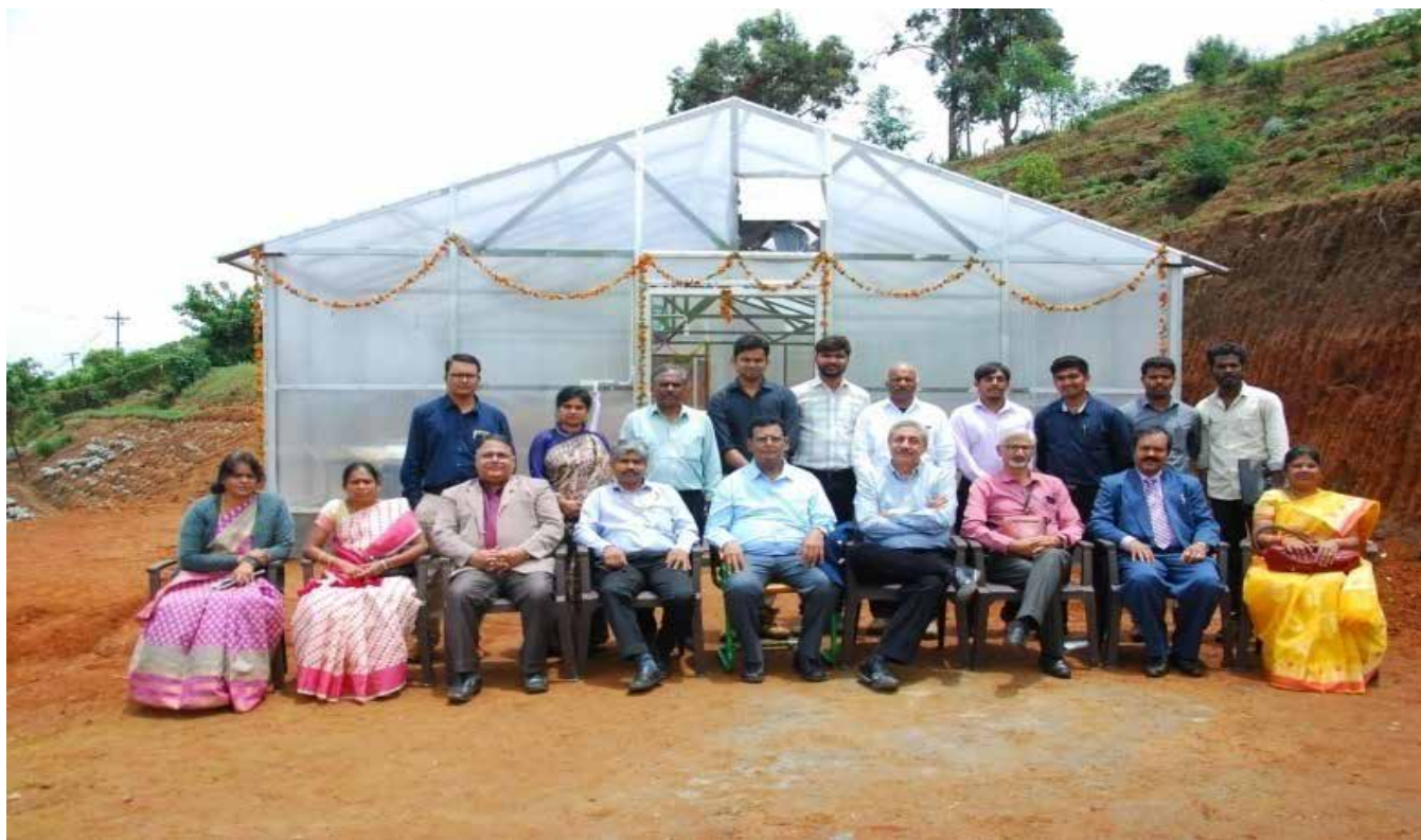
Newly constructed Rigid Poly house at the herbal garden at CMPRH, Emerald, Ooty