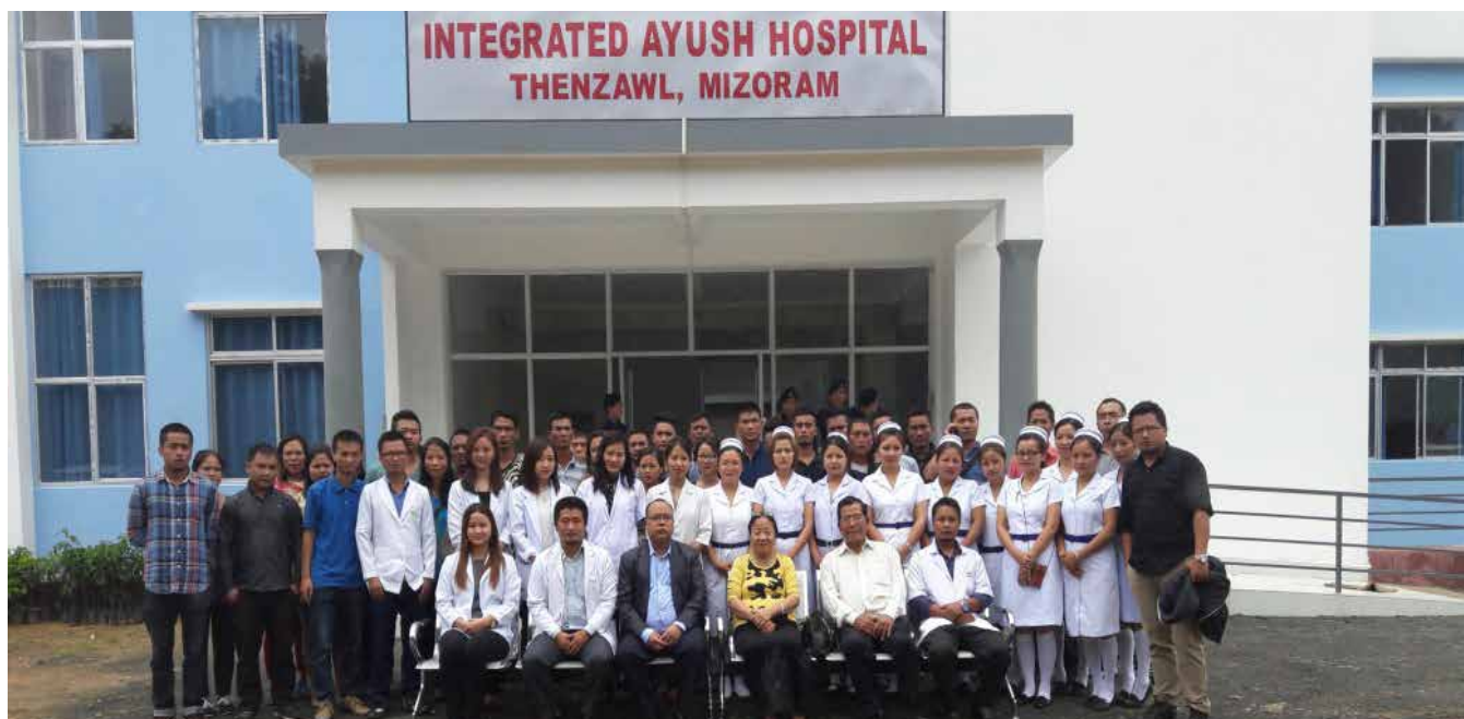
50 bedded Integrated AYUSH Hospital, Thenzawl, Mizoram

5.1.2 So far the Ministry of AYUSH was able to encourage the State/UT Governments for increasing the visibility of AYUSH in respective States/UTs by providing grant-in-aid under the scheme for mainstreaming of AYUSH through co-location of AYUSH facilities at Primary Health Centres (PHCs), Community Health Centres (CHCs) and District Hospitals (DHs), setting up of 50 bedded integrated AYUSH Hospitals, upgradation of AYUSH hospitals and Dispensaries, Upgradation of State Government Under-Graduate and Post-Graduate Educational Institutions, Strengthening of State Government/ Public Sector Undertaking (PSU) Ayurveda, Siddha, Unani and Homoeopathy (ASU&H) Pharmacies and Drug Testing Laboratories (DTL) and Cultivation and Promotion of Medicinal Plants. Under the Mission, States/UT Governments were supported for setting up of new 25 units of upto 50 bedded integrated AYUSH Hospitals during the current year.